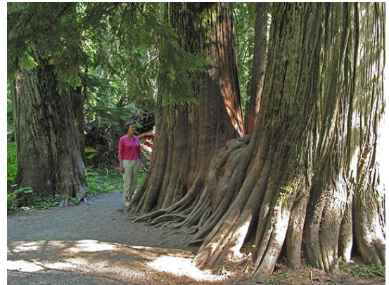
Which elements are dominant?