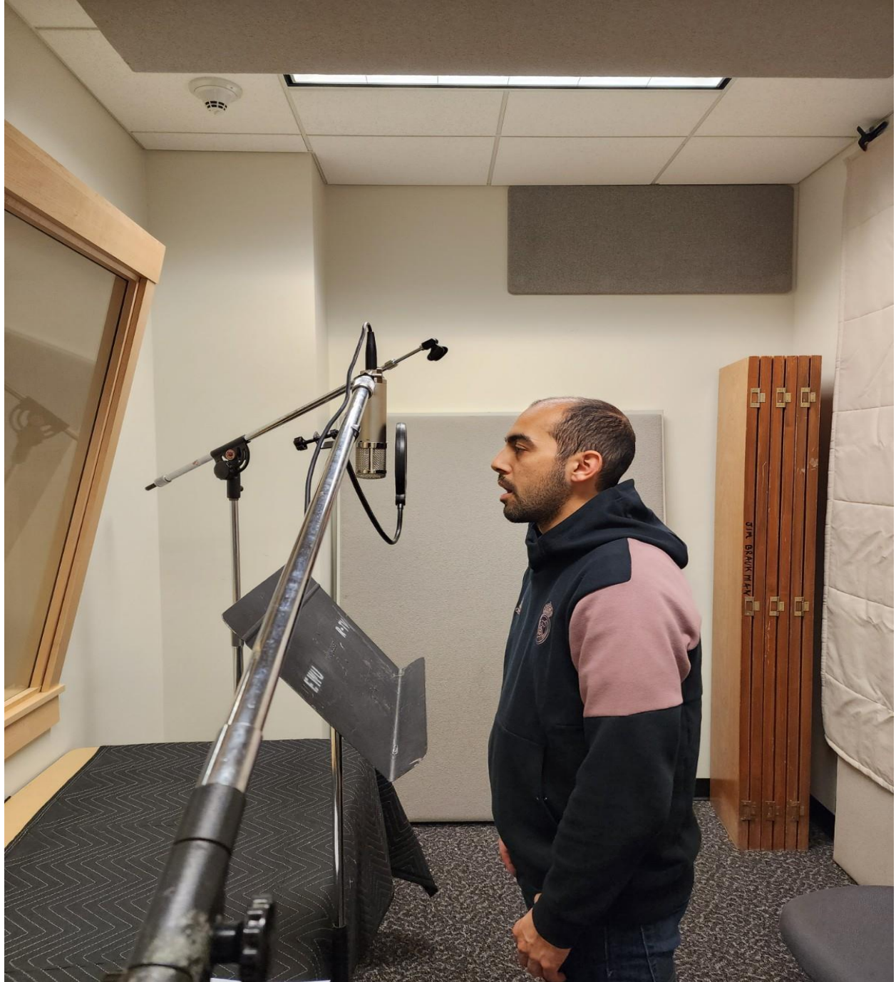
Warm Audio -47Jr (2)