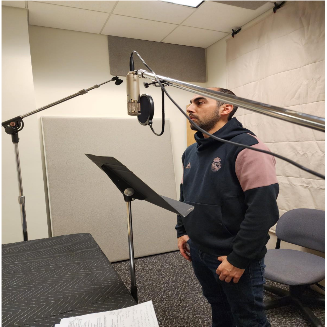
Warm Audio WA-47Jr